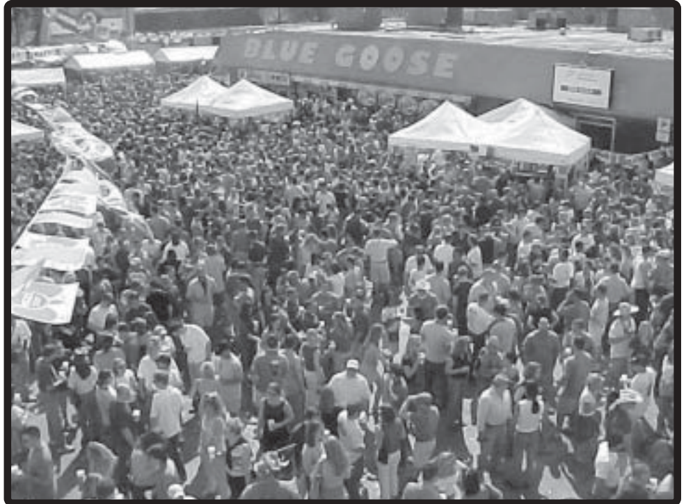
2003 St. Patrick's Celebration, Greenville Avenue

NO COOLERS OR CONTAINERS OF ANY KIND WILL BE ALLOWED IN OR OUT OF THE EVENT AREA.