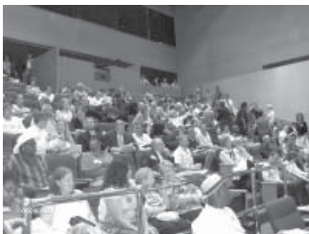
Filled Dallas City Council Chamber day of VPCD hearing